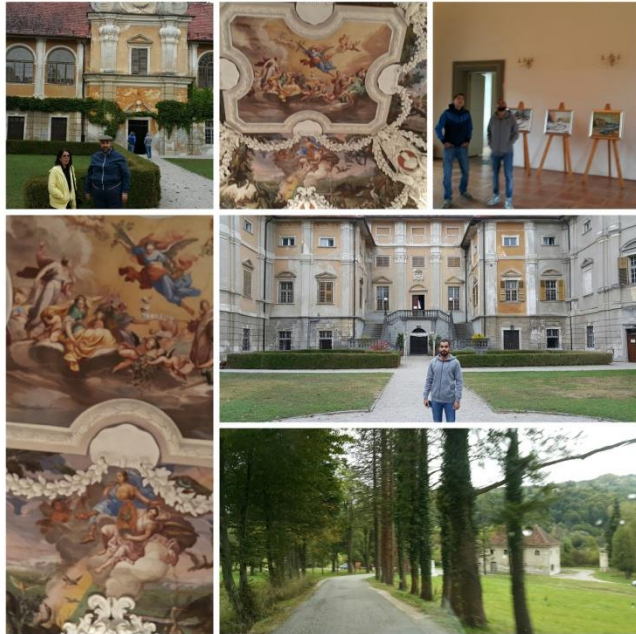
Castle Štatenberg, the old baroque mansion