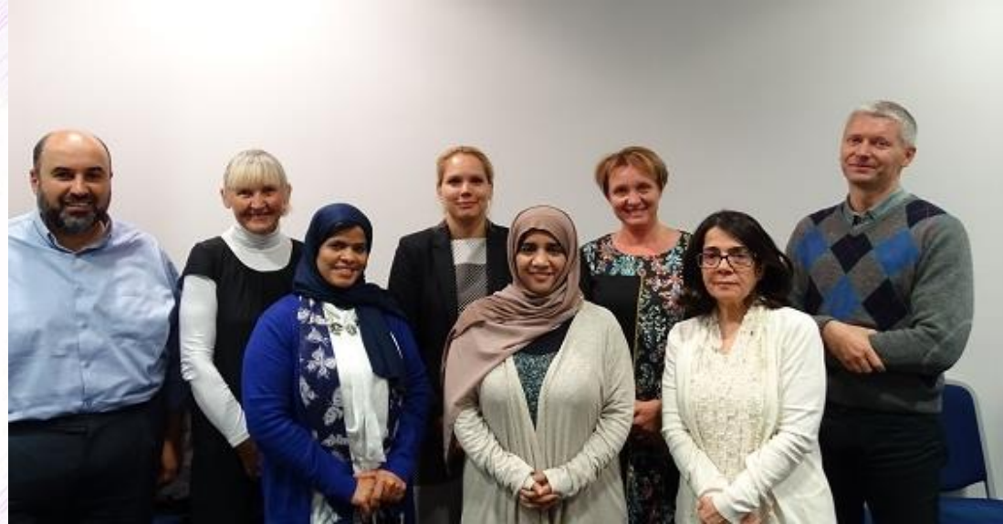
Talking about the positive role of immigrants in destination countries and the role of NGO's